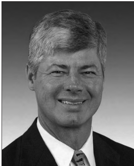
Rep. Bart Stupak (D-Mi.). Opposed bill due to abortion subsidies.

NRLC and other pro-life analysts warned that these broad categories have