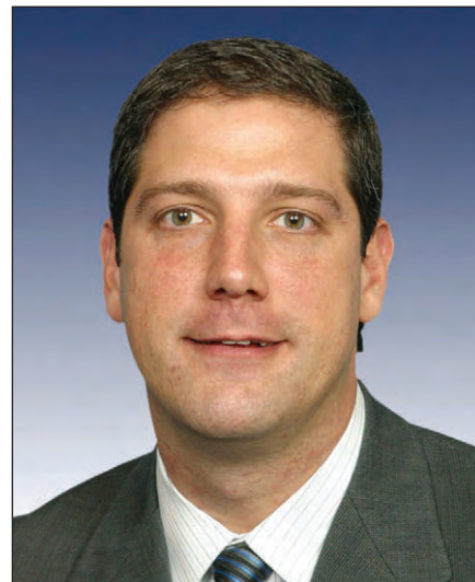
Rep. Tim Ryan (D-Oh.), impersonates pro-life lawmaker.

Speaker Pelosi and other Democratic leaders have the power to make further changes in the legislation before they bring it to the floor in September. The House Rules Committee, an arm of the House Democratic leadership, will issue a list of amendments that can be considered on the House floor. However, this list must be agreed to by the full House through adoption of a resolution, called “the rule,” before the bill itself can be taken up.