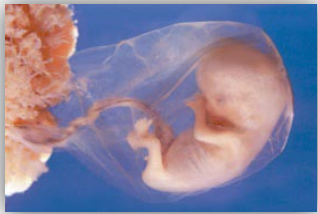
8 Week Old Baby

When does life begin? While birth is certainly a milestone families celebrate with joy, it is actually the culmination of an amazing process that began months earlier.