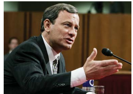
Chief Justice John G. Roberts, Jr.

After the litigator informed Chief Justice Roberts that they were not preserving their rational basis claim, he responded, "Well, we have to assume [the law's rationality], we have to assume it [sic] does, since you're not contending it, don't we?"