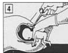
4 The abortionist jams scissors into the baby's skull. The scissors are then opened to enlarge the hole.