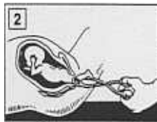
2 The baby's leg is pulled out into the birth canal.