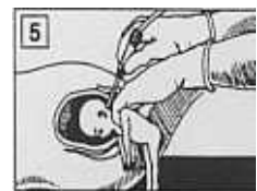
5 The scissors are removed and a suction tube is inserted. The child's brains are sucked out causing the skull to collapse. The dead baby is then removed.

Senator Daschle claims that he wants to "ban" what he calls "late-term" abortions, including partial-birth abortions. A surprising initiative, coming from a senator with a 100% NARAL rating for 1996?