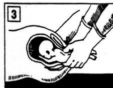
3 The abortionist delivers the baby's entire body, except for the head.