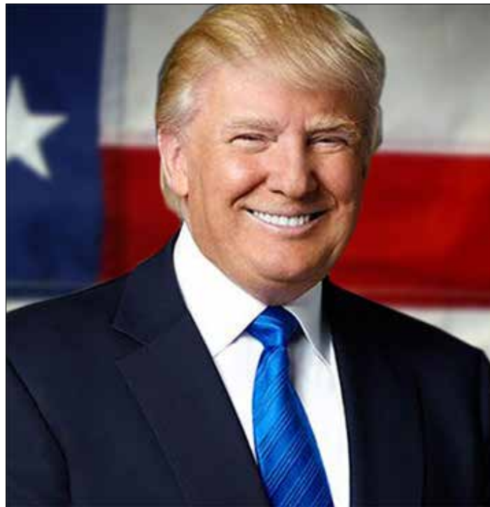
Pro-life President Donald Trump