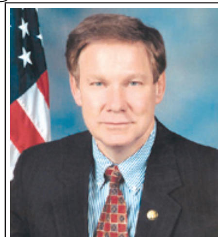
Rep. Tom Davis (R-Va.), backs Waxman bill to regulate citizen contacts to federal officials.