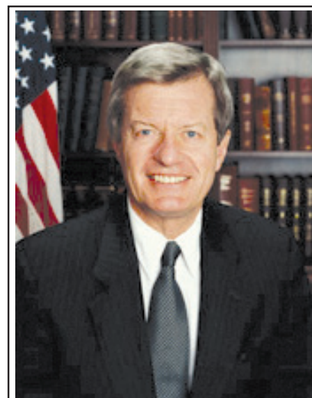
Senate Finance Committee Chair Max Baucus (D-Mt) wants to cut payments to private-fee-for-service Medicare plans.