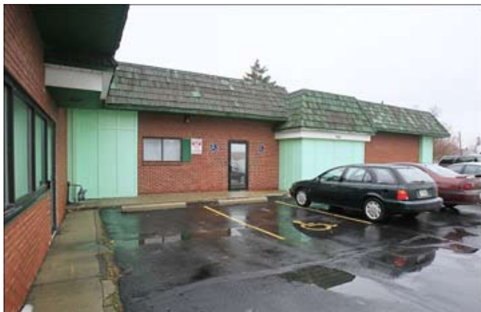
Capital Care Network

Editor's note. As promised, Capital Care Network subsequently appealed the decision.