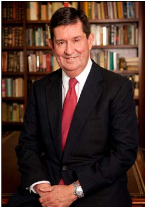
Judge Emilio Garza

Although understandably hailed by the usual suspects, the verdict delivered by a split three-judge panel of the 5 th U.S. Circuit Court of Appeals striking down a Mississippi law that required abortionists to have admitting privilege sat at a local hospital was deeply flawed.