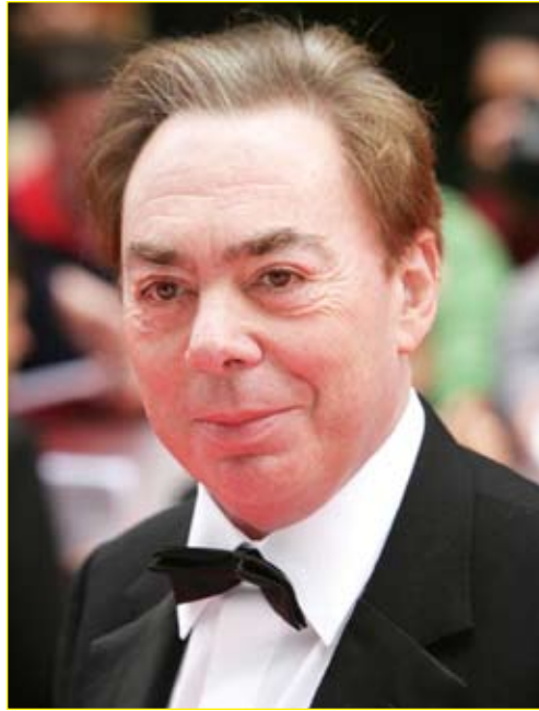
Andrew Lloyd Weber

"He is among members of the Lords likely to oppose the bill tabled by Lord Falconer, the former Lord Chancellor, to legalise 'assisted dying,' which will have its first parliamentary airing [last Friday]. It came as Dominic Grieve, who until this week's reshuffle was the Government's chief law officer, said the