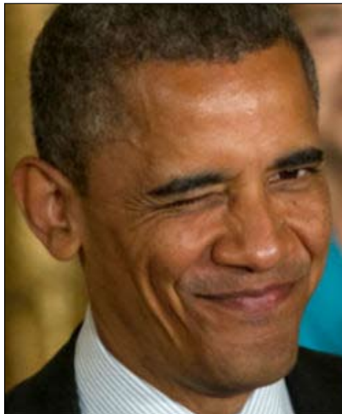
Pro-abortion President Barack Obama

Nor do they want to talk about laws to protect unborn children capable of feeling pain from the horrors of abortion. Pro-abortion Senate Majority Leader Harry Reid (D-Nv.) simply