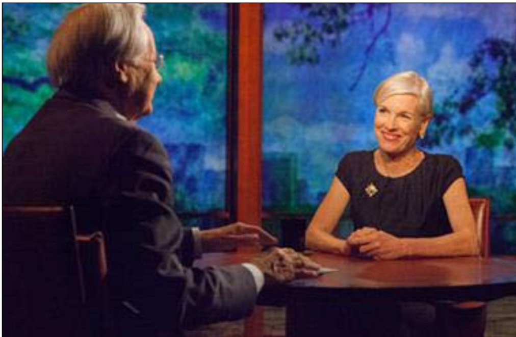
Bill Moyers interviewing Planned Parenthood President Cecile Richards

Here are just a few nuggets at billmoyers.com. As you would expect from Moyers, many comments are snarky, snide, and over the top.