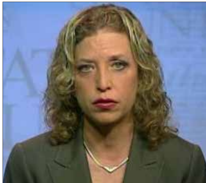
Pro-abortion Democratic Party Chair Debbie Wasserman Schultz (D-Fl.)

at a drop of a pro-life hat. So we shouldn’t be terribly surprised—or surprised at all—that she would claim that such commonsense legislation “will