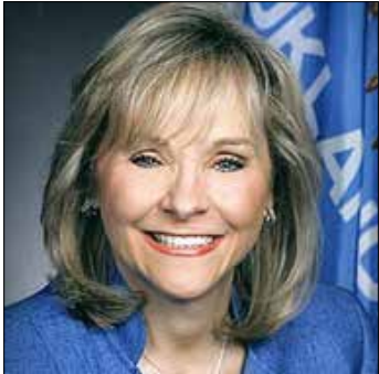
Pro-life Oklahoma Gov. Mary Fallin

On May 6, when Oklahoma Gov. Mary Fallin signed HB 1409 into law, it meant that there are now four states that allow women considering an