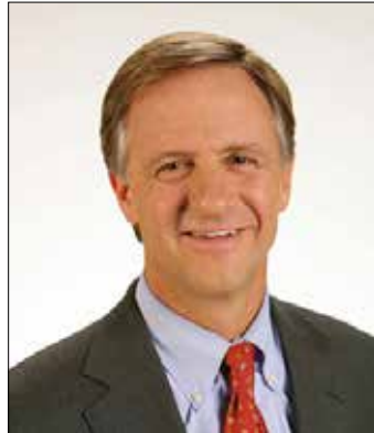
Tennessee Gov. Bill Haslam

legislators, the voters—"more leeway" in the regulation of abortion facilities in Tennessee.