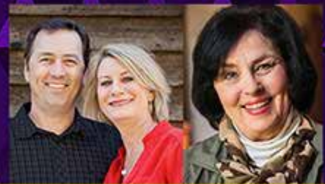
Alan, Lisa, & Miss Kay Robertson