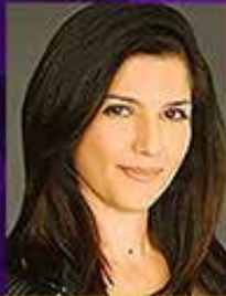
Rachel Campos Duffy