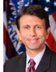
Bobby Jindal Governor of Louisiana