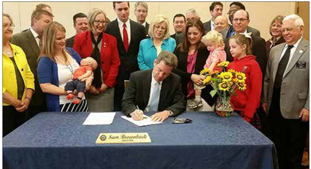
Attendees at the ceremonial re-signing of SB 95 in Lenexa, Kansas, include legislators and Kansans for Life members.

are most affected, the unborn, cannot be here today. So we stand in solidarity with those unborn children by standing here for them today.