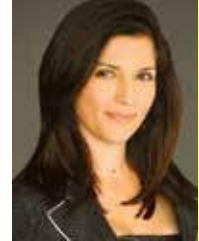
Rachel Campos Duffy Author & TV Personality