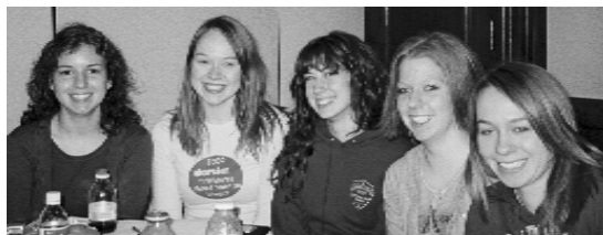
Trainees at the 2007 Youth Pro-Life Leadership Summit

"When you tell someone you are pro-life, they may ask you what that means. If you don't know what to say, it makes a bad impression. We need to know how to explain what "pro-life" means.