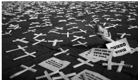
Mexico Pro-Life Crosses

It is too bad that Hillary wasn't listening.