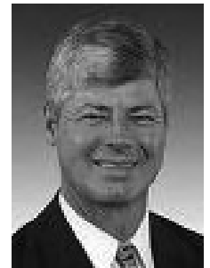
Rep. Bart Stupak

Pro-life Americans, who have bombarded Congress with e-mails and phone calls telling their representatives that they don't want abortion funded as part of health care, can be proud of this victory. They have made it clear that the pro-life population is active and concerned with what is done by Congress