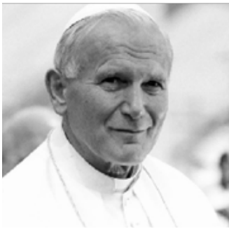
Blessed John Paul II

The late Pope John Paul II was beatified on May 1 by Pope Benedict XVI in Rome. Throughout his life John Paul II was a champion who fought to protect every vulnerable person, especially the unborn and the elderly. The beatification of the late pontiff officially declares that he lived an exemplary life of virtue and that God granted a miracle to be worked through the intercession of John Paul II.