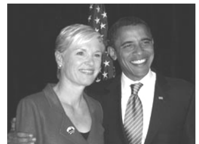
Obama with Planned Parenthood director, Ceceil Richards

will not yield." Mr. Obama also promised, "The first thing that I would do as president is sign the Freedom of Choice Act (FOCA). That's the first thing I would do." This act would nullify any state or federal law that would prevent access to abortion. More recently, Planned Parenthood has been an adamant supporter of Obamacare, which promises to increase significantly the federal funds received by Planned Parenthood.