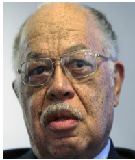
Abortionist Kermit Gosnell