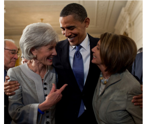
President Barack Obama hugs HHS Secretary Kathleen Sebelius and then-House Speaker Nancy Pelosi after signing the Obamacare law on March 23, 2010.

Justice Kennedy highlighted the importance of this case in the fight against abortion. He confronted the Obama Administration’s lawyer, saying that insofar as a person could be coerced by the government to violate its conscience in any area, it follows that “a for-profit corporation could be forced in principle to pay for abortions.”