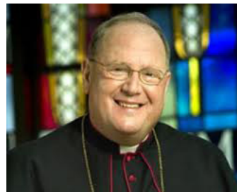
Timothy Cardinal Dolan