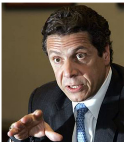
Governor Andrew Cuomo