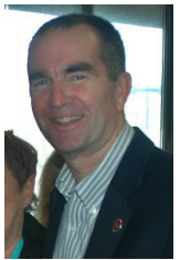
Gov. Ralph Northam

Virginia - Governor Ralph Northam appeared on a program on WTOP, radio and stunned listeners when he defended a bill to allow abortion up to birth in the Commonwealth with absolutely no restrictions. According to Gov. Northam if the child survived the abortion then the child's life would be saved IF, "that's what the mother and the family desired."