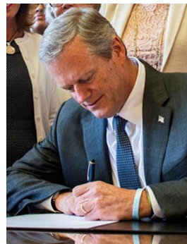
Gov. Charlie Baker

July 27 - Massachusetts Gov. Charlie Baker signed a pro-abortion bill Friday to keep the killing of unborn babies legal in the event that the U.S. Supreme Court overturns Roe v. Wade .