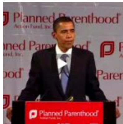
Barack Obama Addresses Planned Parenthood

For more information on this issue, see www.nrlc.org .